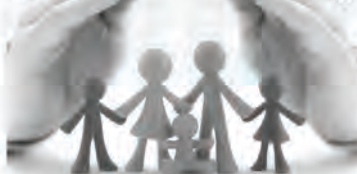
Children, Women & Men

Identify and respond to children, young people, women and men at risk.