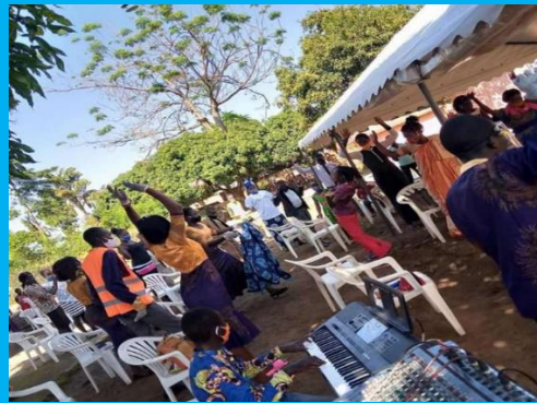
The CRC church in Arua, Uganda